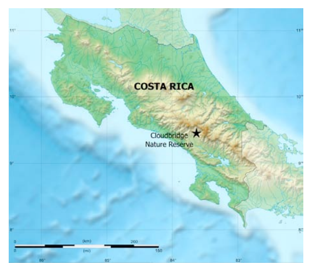
Figure 1. Location of Cloudbridge Nature Reserve in Costa Rica. Map edited from Wikimedia Commons image.

Cloudbridge is located in the south-central region of Costa Rica, on the southern slopes of the Talamanca mountain range and adjacent to Chirripó National Park, a UNESCO World Heritage Site. CNR encompasses 280 hectares (almost 700 acres) of tropical (pre-)montane cloud forest habitat, ranging from 1500 m to 2650 m in elevation. Only small portions of its land contain primary cloud forest; the majority is comprised of abandoned or repurposed pastures in various stages of succession returning to the forest's natural climax state.