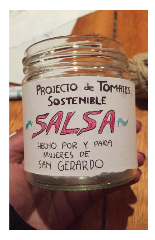
"Our first prototype"

delicious salsa recipe along with a simple guideline outlining how to properly make conserves.