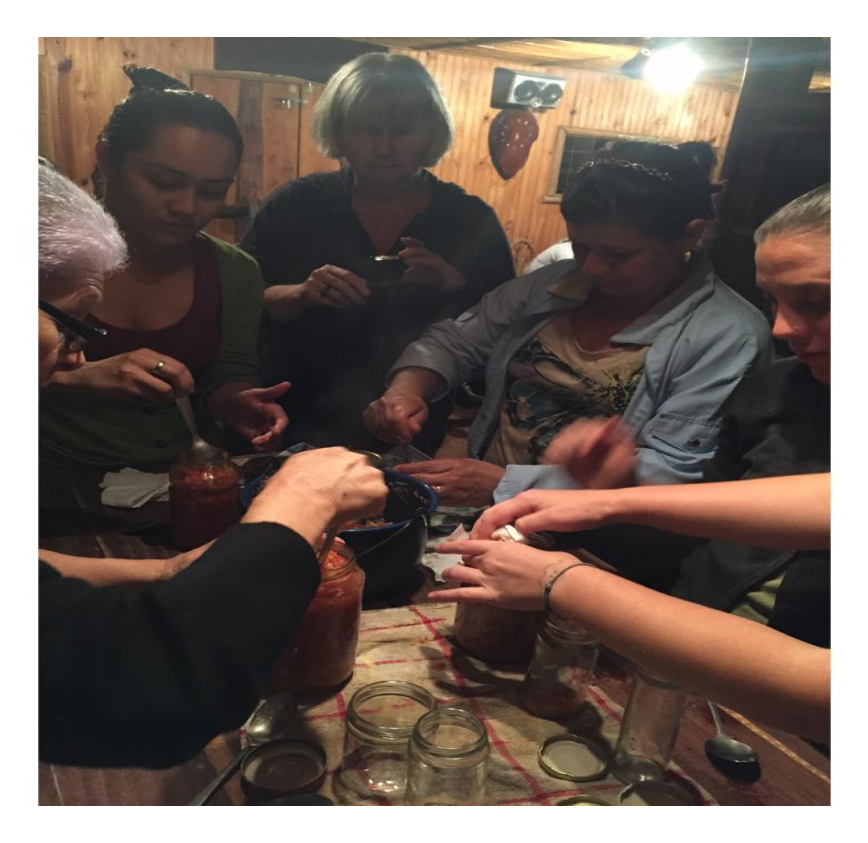
Women putting the salsa in the jars at the workshop.