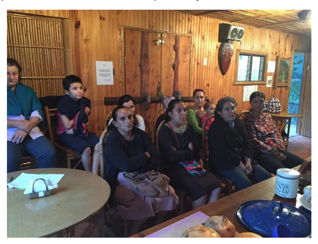
Some of the local women who attended the workshop.